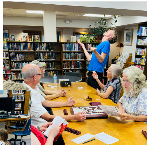
Board Game Afternoons