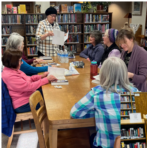
Monthly Book Discussion